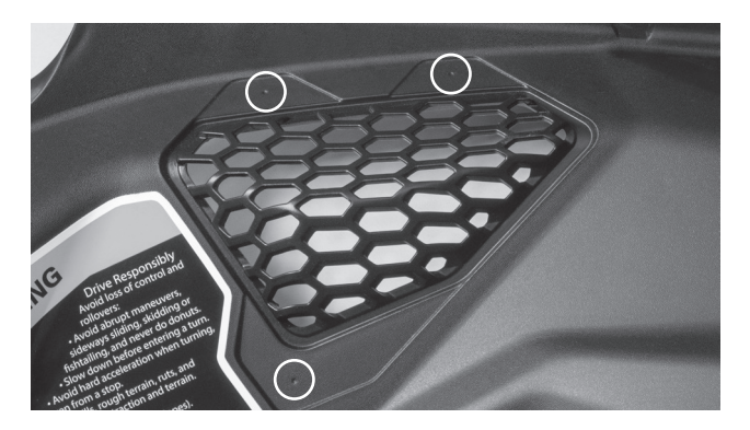
Step 12 - Using a <sup>3</sup>/<sub>16</sub>" drill bit, drill though the panel at each dimple location.

Step 11 - Turn the panel over and locate the three (3) dimples around the molded speaker grill. Two (2) on top and one (1) on bottom of the grill area.