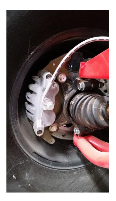
Figure 4: loosen the bolt a tad, just enough to turn the fitting closer to the bleeder as shown, retighten bolt.