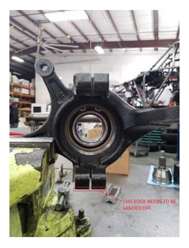
Figure 1: Notes show the area that will need trimming.