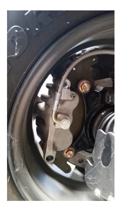
Figure 3: This is stock. The brake line fitting is far from the bleeder screw, this kicks the brake line up close to the wheel.