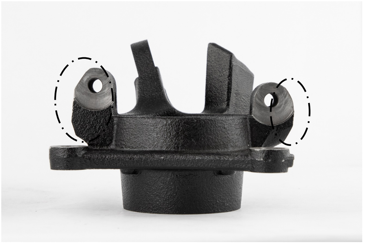
Figure 2 (above): Modified Spindle