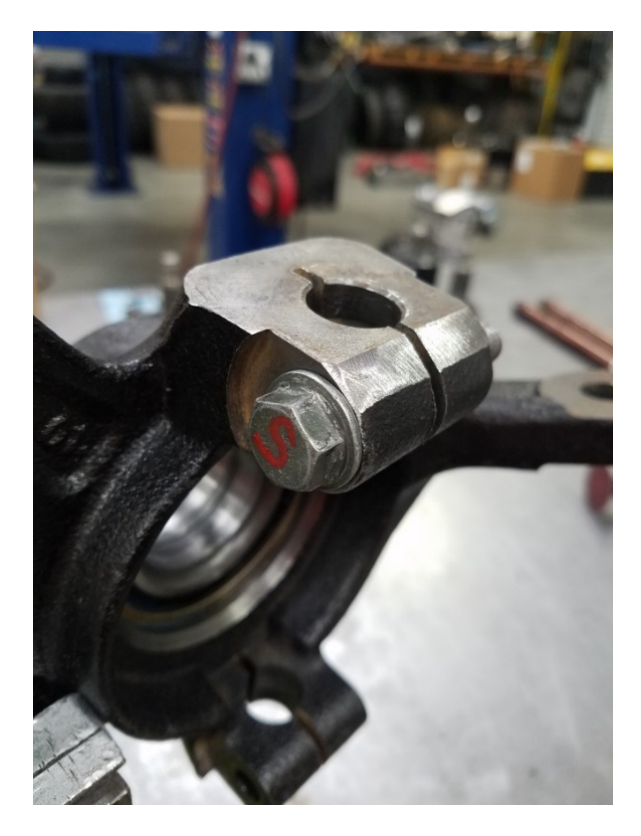
Figure 5: Grinding done on inboard side of top, material removed right up to the flange of the bolt and nut.