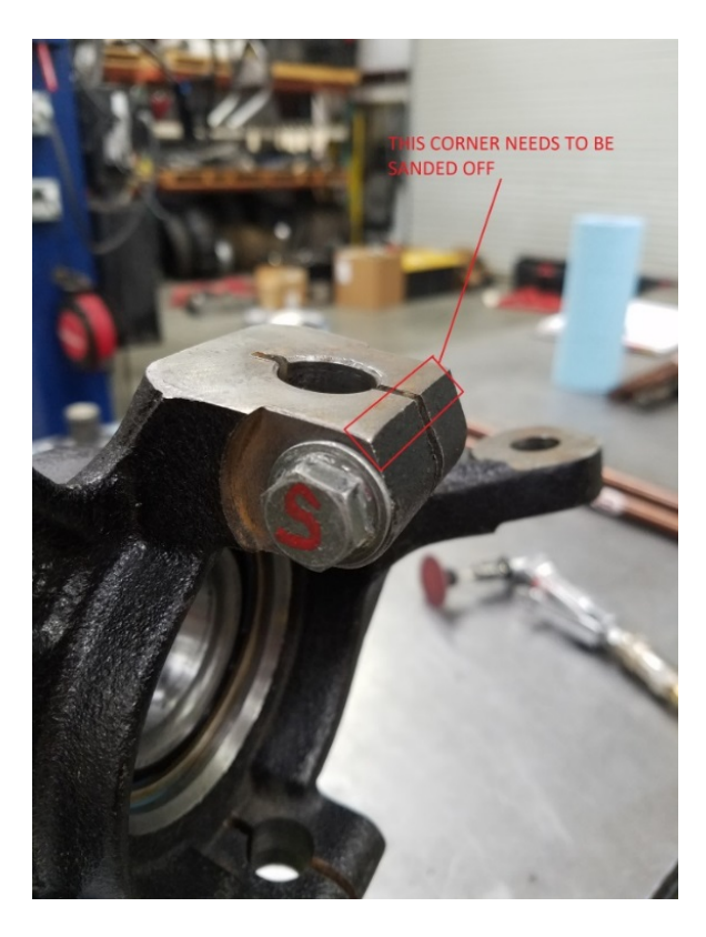
Figure 3: more detail shown of the area that needs to be removed, which must be done in both locations shown in Figure 1.