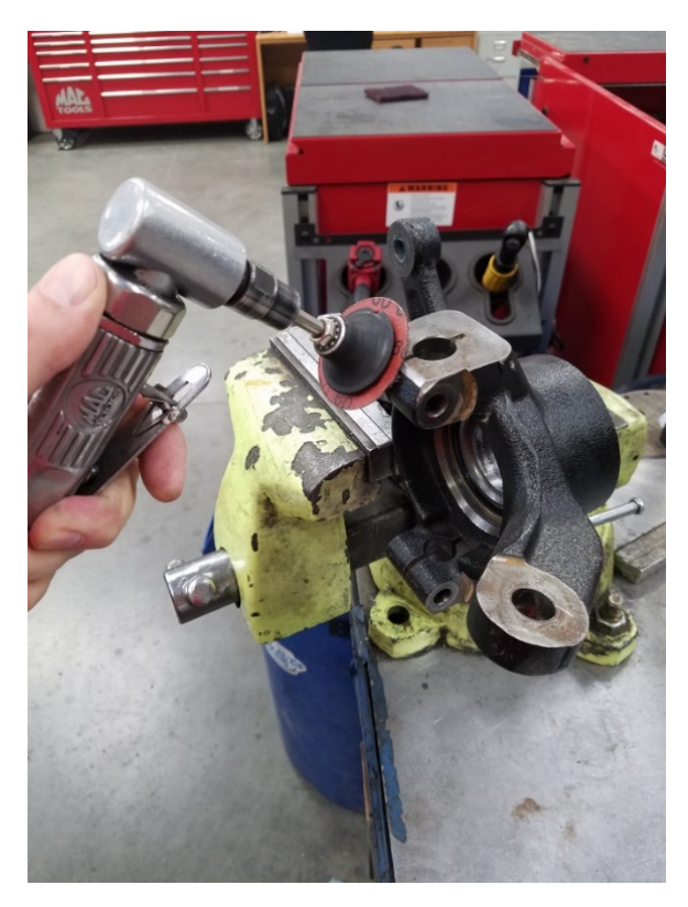
Figure 4: Sanding the corners off

Figure 3: more detail shown of the area that needs to be removed, which must be done in both locations shown in Figure 1.